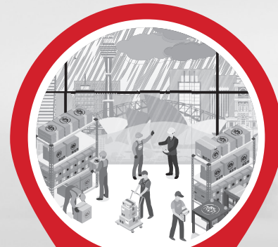
Supply Chain Disruptions