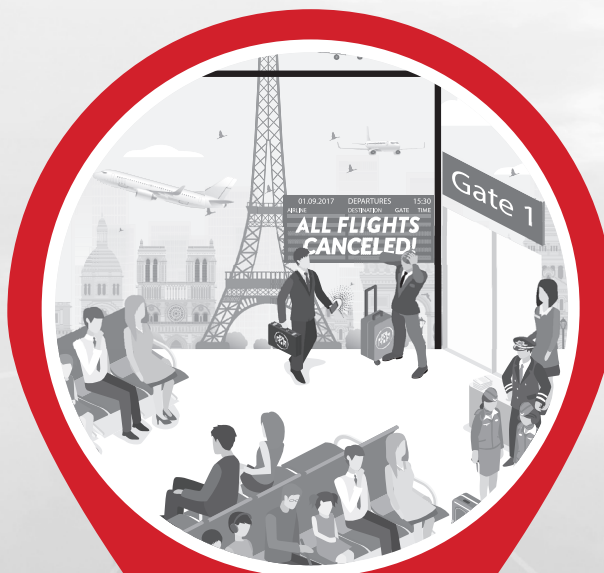
Risk to Traveler & Worker Safety